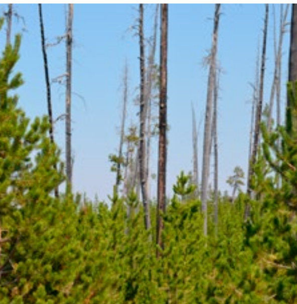
Above right: CPNR participants meet at the Wyoming Game and Fish office in Lander.

The Ruckelshaus Institute seeks applicants to the second Collaboration Program cohort. The program will run from April 2014 to March 2015 and will include six sessions. To apply, visit the Ruckelshaus Institute website.