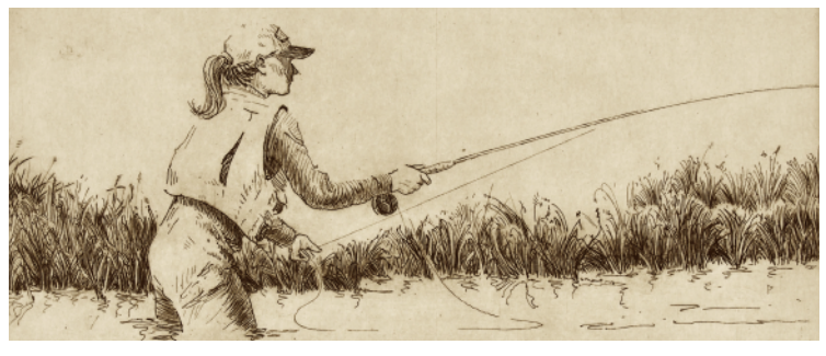
This project was designed to understand how Bureau of Land Management permittees, including ranching and recreation-based businesses, in Colorado are vulnerable to climate change and how they and managers could better adapt.

Researchers interviewed 60 stakeholders including BLM staff, livestock ranchers, and recreation outfitters in the BLM Gunnison and Little Snake field offices of Colorado. Researchers chose this region due to its large extent of public lands and the many users dependent upon them. Ski resorts, rafting companies, hunting outfitters, and agricultural producers all use public lands. By asking public land permittees about local changes in climate and how they were impacted, researchers determined the extent to which public land users in the area are vulnerable to climate change. Researchers also examined how management decisions inhibited or facilitated their ability to respond to the change. In addition, researchers interviewed BLM agency employees about climate change impacts, management responses, and the decision-making context.