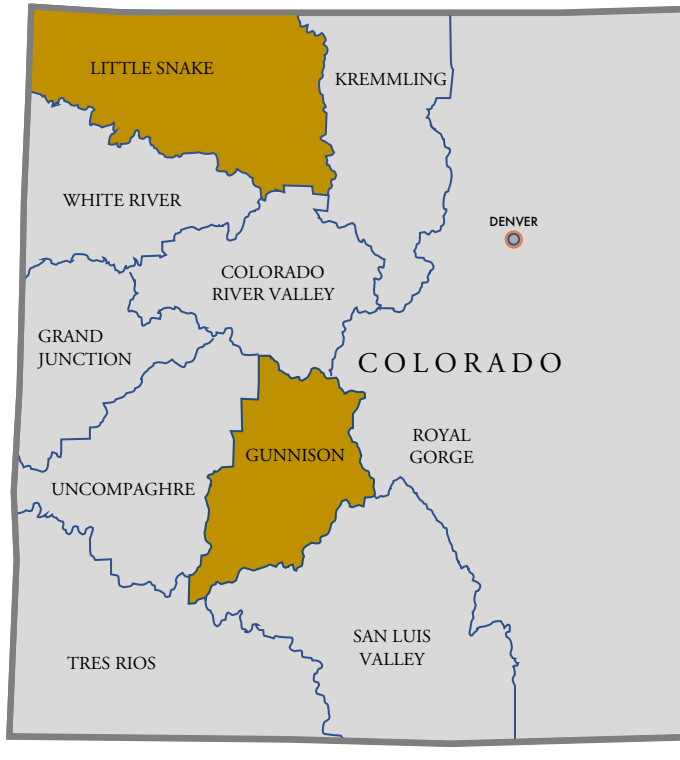
The researchers interviewed stakeholders in two BLM units in western Colorado, the Little Snake and Gunnison Field Offices, where nearly half of all jobs are dependent on natural resources and tourism.

Interviews revealed current land management practices have limitations for responding to user vulnerabilities exacerbated by climate change. Although agencies are using innovation to respond to vulnerabilities such as by increasing collaboration, there are structural barriers that limit their capacity to respond. Barriers include inflexible management structures, limited cross-agency collaboration, agency uncertainty, limited recreation permits, and slow process for range improvements. There is a need for agencies to be more nimble, allowing for in-season adaptation.