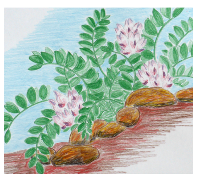
For many species, particularly those that occur primarily on nonfederal lands, states have led recovery implementation. In 2018, conservation carried out by Utah state agencies helped move the deseret milkvetch off of the federal list of endangered and threatened plants.

Pre-Listing Conservation: Proactive conservation is essential before decline triggers a listing under the ESA. Opportunities exist at both state and federal levels to promote proactive conservation. For example, the FWS can provide assurances to private landowners who enter Candidate Conservation Agreements with Assurances (CCAAs), while states can administer programmatic CCAAs as a way to effectively engage large numbers of landowners in conservation. These tools receive limited funding from