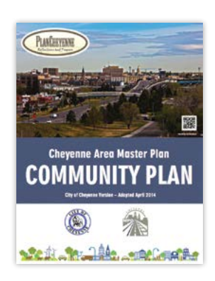
The City of Cheyenne, Wyoming, plans for extra-territorial zones that extend beyond the city's municipal boundaries in its community master plan, known as PlanCheyenne.

Example: In 2003, the City of Cheyenne Board of Public Utilities acquired 20,000 acres of land southwest of the city for the purposes of landfill and water development for the city. Later, in 2005, the city purchased an additional 18,000 acres of land from The Nature Conservancy preserved by conservation easement. These properties are managed by the City of Cheyenne, Larimer County, and The Nature Conservancy, and provide opportunities for low-impact recreational activities.