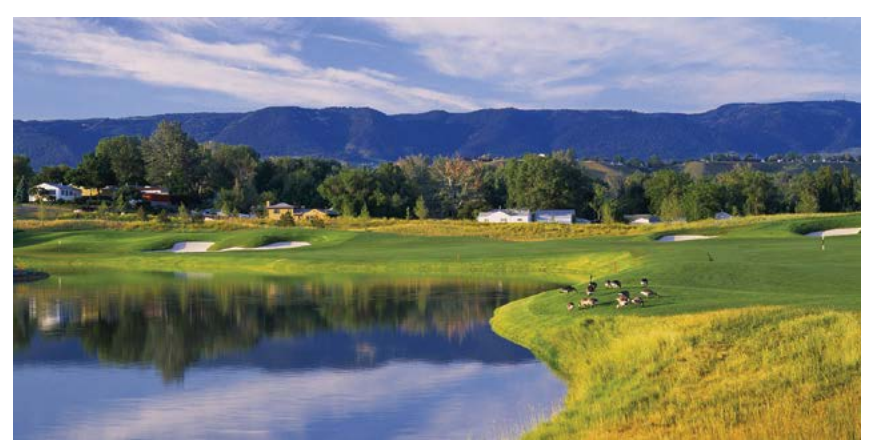
Once the site of one of the largest oil refineries in the world (left), the Platte River Commons located in Casper, Wyoming, was created through a joint powers agreement between the City of Casper, Natrona County, and BP-Amoco. Today the site is home to the Three Crowns Golf Club (right), among several other public amenities.