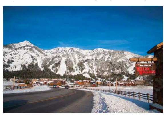
The Teton Village Improvement District provides municipal services to residential areas of Teton Village.

Extra-territorial zones are areas that extend beyond the incorporated boundaries of towns and cities into county jurisdiction for which municipalities are able to zone and plan. Extra-territorial zones serve as a buffer to allow municipalities to meet land use standards, for example the installation of roads and water or sewer lines, to integrate areas of new development into the existing system. Prior to July 1, 2019, municipalities in Wyoming were authorized to plan and zone in areas extending one-half mile outside their incorporated boundaries, subject to nullification by county government. However, legislation passed in the 2018 Budget Session of the Wyoming State Legislature restricts a municipality's authority