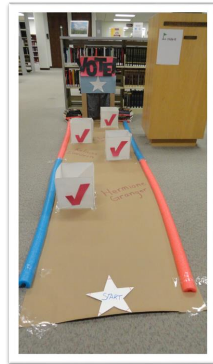
Miniature Golf Hole, August 2017

Also, have you got a document on your mobile device? You can easily print it now. See how at http://microlab.uwyo.edu/mobileprint/ .