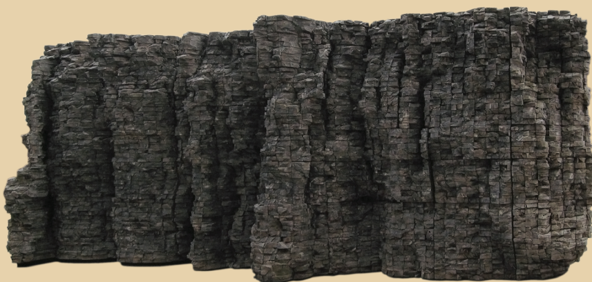
© Ursula von Rydingsvard, Doolin Doolin

Sculpture: A Wyoming Invitational is the largest exhibition of contemporary public art mounted in Wyoming. The exhibition is a cooperative project between the University of Wyoming Art Museum and the University of Wyoming, various agencies of the City of Laramie, and the Albany County Public Library.