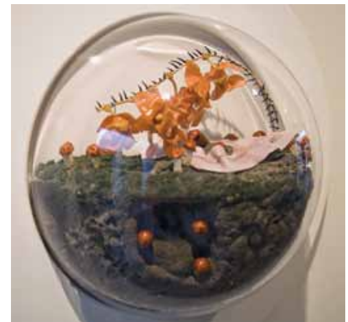
Brian Burkhardt (American, b. 1971), Dendrobium Oospore Protectus (The Egg Protector) , mixed media, 23 x 23 x 8 inches, W. Sherman & Dorothy Burns Estate Fund Purchase, University of Wyoming Art Museum Collection, 2009.10

These acquisitions present the opportunity for the Art Museum to continue to build a substantial and focused comprehensive collection for future generations and demonstrate different means that artwork becomes part of the permanent collection – through purchase with endowment funds and gifts of artwork.