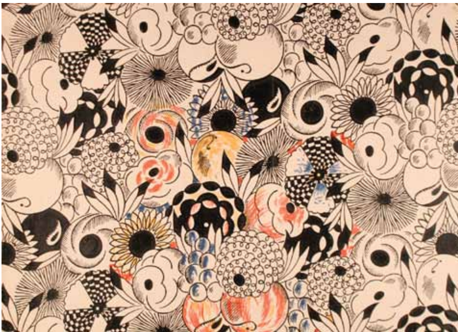
Raoul Dufy (French, 1877-1953), Composition florale (Floral Composition), c. 1918-1928, empreinte, gouache, 29-7/8 x 15-1/2 inches