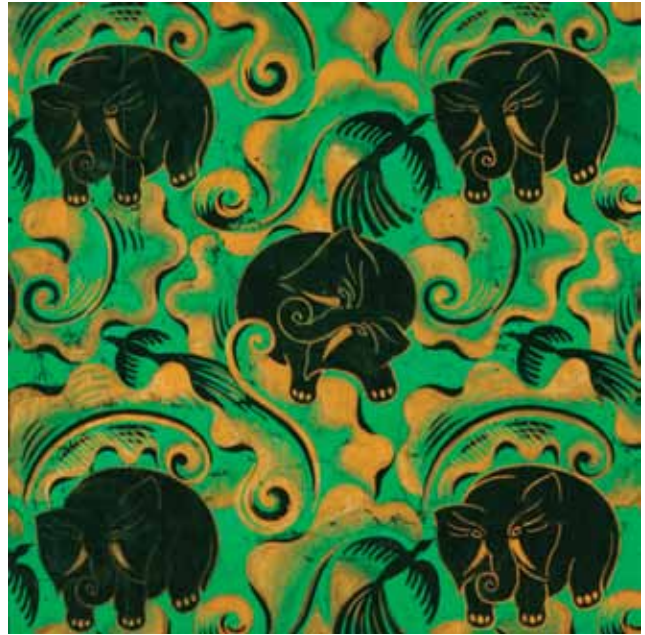
Raoul Dufy (French, 1877-1953), Éléphants (Elephants) , c. 1920-1922, watercolor, gouache, 14-3/4 x 14-3/4 inches, courtesy of The Humanities Exchange

Dufy's work is also represented in the University of Wyoming Art Museum's permanent collection. The watercolor, La Plage Et Le Port is currently on view in the exhibition, Artists from France: Paintings and Prints from the Art Museum Collection . A comparison between this painting and Dufy's fabric designs highlight the stylistic similarities in his handling of paint, color, and composition.