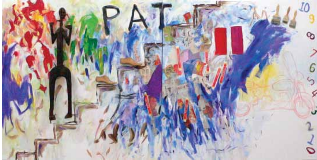
Neltje (American, b. 1934), PAT: Paroxysmal Atrial Tachycardia , 2007, mixed media, acrylic on canvas, 72 x 144 inches, courtesy of the artist

May 22 – Aug. 28, 2010; South Two Gallery