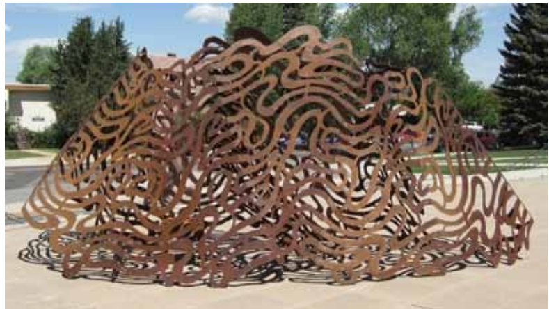
Linda Fleming (American, b. 1945), Refugium , 2007, laser cut steel, 105 x 108 inches, courtesy of the artist

Watch the Art Museum blog at www.uwartmentuseum.blogspot.com or become a Fan of the UW Art Museum on Facebook to hear more when sculptures are being added to the exhibition.