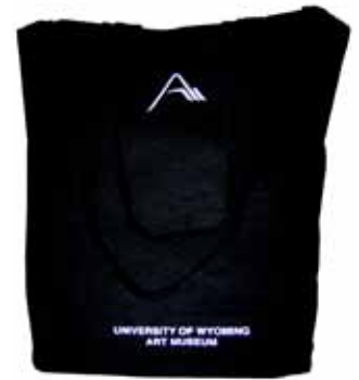
Art Museum Tote made from durable cotton twill fabric. Black. Measures 14 1/2" (H) x 15" (W) x 5" (D) with an 11" shoulder drop.