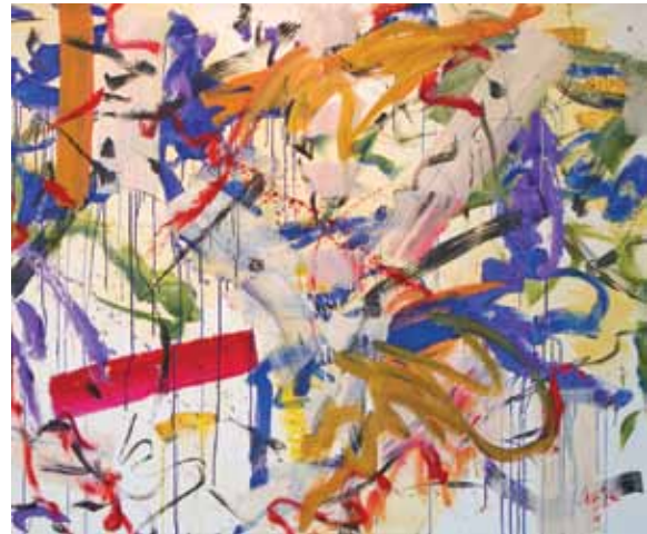
Neltje (American, b. 1934), I Couldn't Resist , 2007, acrylic on canvas, 60 x 72 inches, courtesy of the artist

Like all of her pieces, Neltje's new works also tell stories. Using colorful papers and newspapers from her many travels, and objects from friends and colleagues, she creates work that is personal and