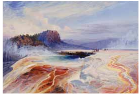
Framed archival quality reproduction print from the Art Museum Collection. Thomas Moran (English /American, 1837 – 1926), The Great Blue Spring of the Lower Geyser Basin, Yellowstone, 1875 .