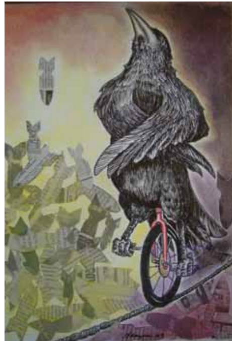
Karyne Dunbar (Shell, WY) Oblivious , 2009, mixed media, 12-1/2 x 9-1/2 inches, from the exhibition Contemporary Art in Wyoming , image courtesy of the artist

Educational packets are available for each exhibition. These materials provide additional background information and suggestions for teaching and learning about the artists and their media. The exhibitions are available without a rental fee to Wyoming institutions. The only cost is one-way transportation. The exhibitions are interpreted, self-labeled, and crated for travel. Sample press releases and images are provided for local promotion.