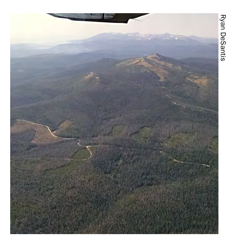
Figure 3: Note the widespread, but also patchy nature of MPB damage across a landscape. Photo was taken in 2016 above the Medicine Bow National Forest.