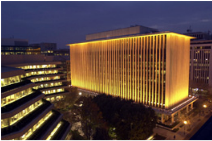
National Geographic Society Headquarters